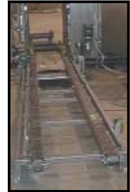
Optional Stack Feed Conveyor